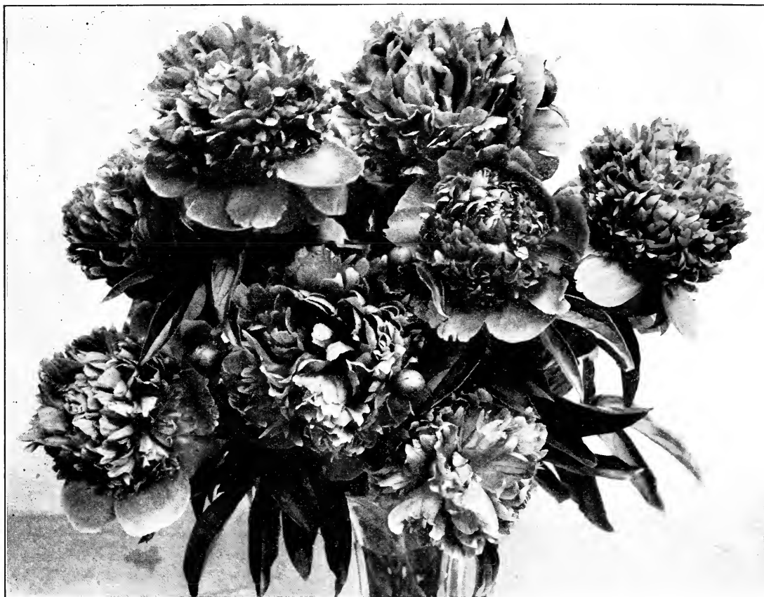
Augustin d-Hour—One of the Best Reds